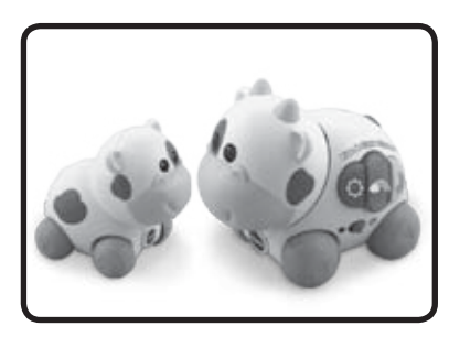
- One instruction manual

- One VTech® Kiss & Care Cows™ learning toy